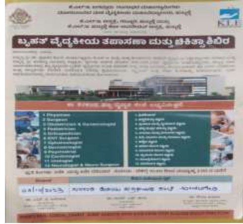
Health check up camp at Anchatageri