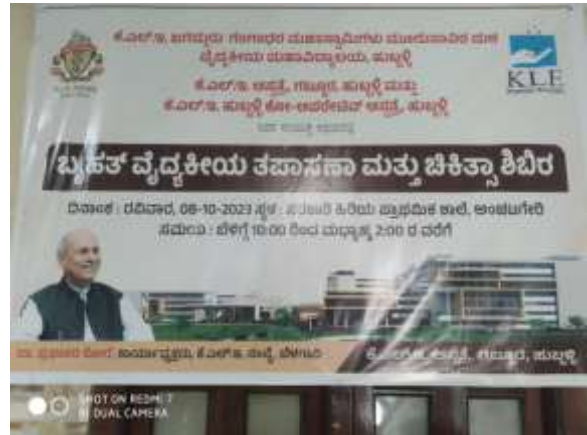
Health check up camp at Anchatageri