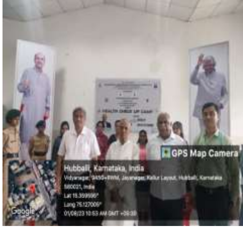
Health check up camp at Vidyanagar Hubballi

Email: infojgmmmc@kledeemeduniversity.edu.in ☎ 0836-2228244