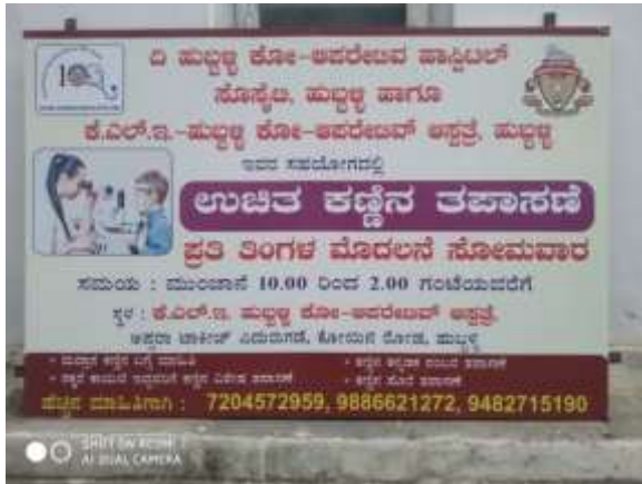
Health check up camp at Co operative Hospital ,Hubballi