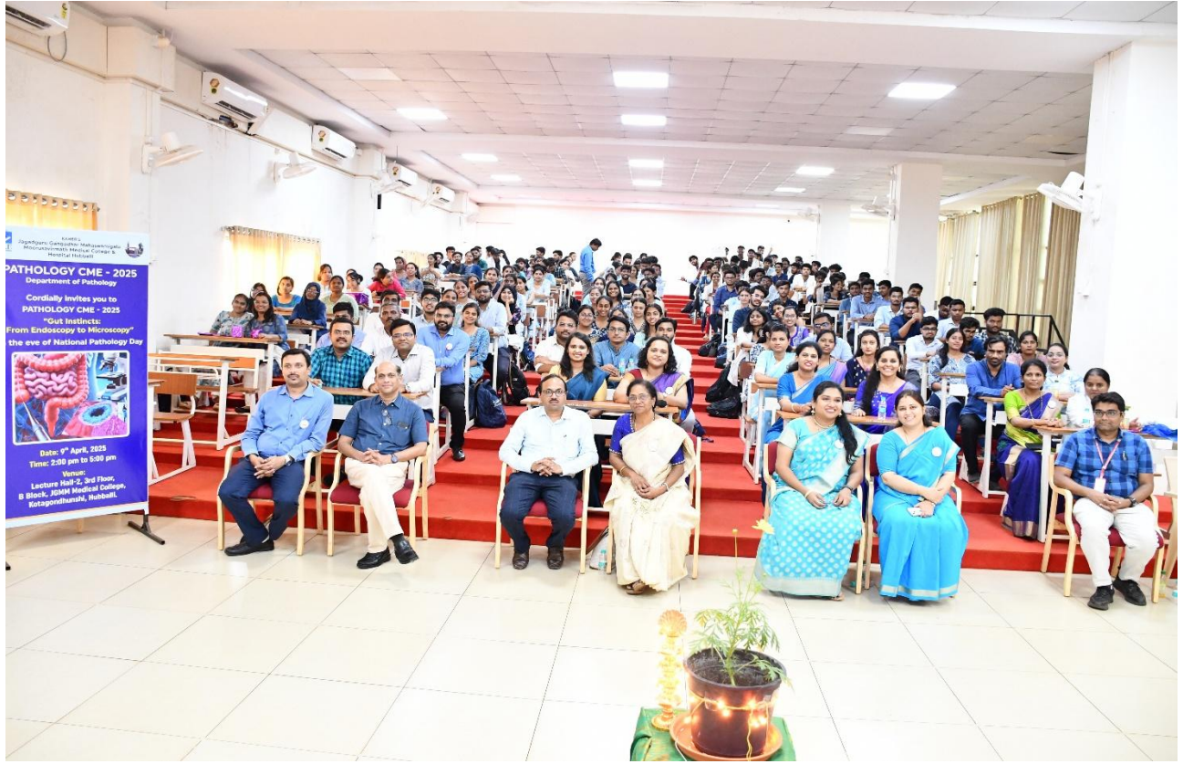
Organising Committee, Department of Pathology, JGMMMC with MBBS Phase II students