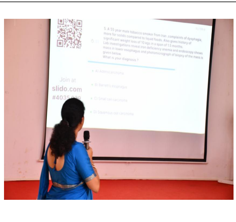
Interactive live quiz “GI Showdown – Jhatpat live quiz” (Slido platform) by Assistant Professors, Department of Pathology, JGMMMC, Hubballi