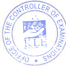
Controller of Examinations KAHER, Belagavi.

Kindly notify it to the concerned departments and display it on the college notice board prominently for information of the students.